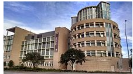
The Mitchell Physics Building on Texas A&M University's campus.

The vast majority of this amount is related to science, environmental sustainability, and sustainability science-related fields, including the foundation's current grant-making programs which focus on sustainability science, clean energy, water, and natural gas sustainability.