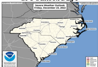
SPC Outlook Day 1