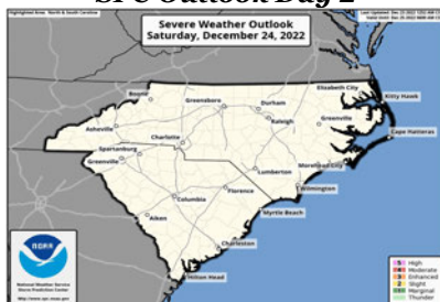
SPC Outlook Day 2