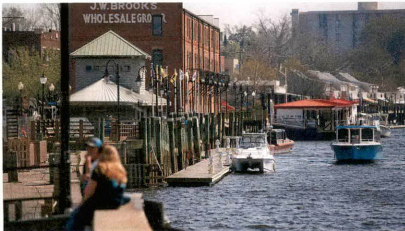
The Cape Fear River waterfront in Wilmington